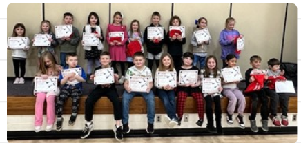
Life Skill Leaders Kdg. thru 2nd