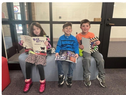
Grab a good book