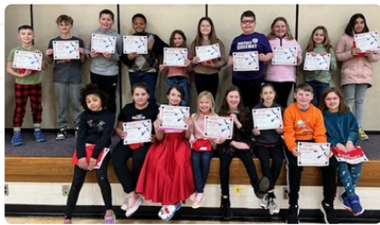
Life Skill Leaders 3rd thru 5th