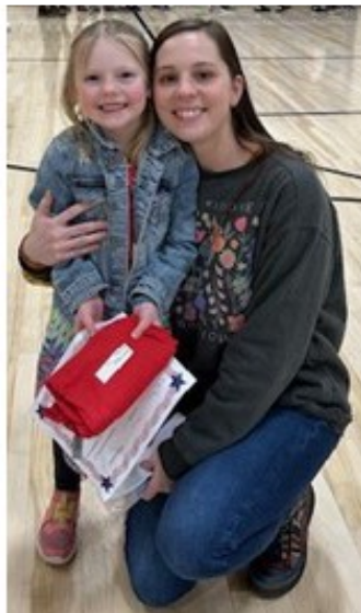
Life Skill - Joy