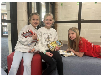
Reading in the Library

Apr. 23~Grades 2 and 3 Spring Concert 7:00 at NorthWood High School